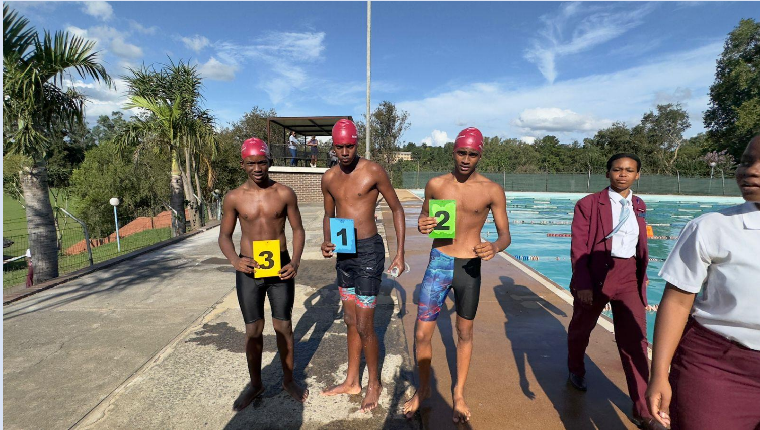
OUR WINNING TRIO!!