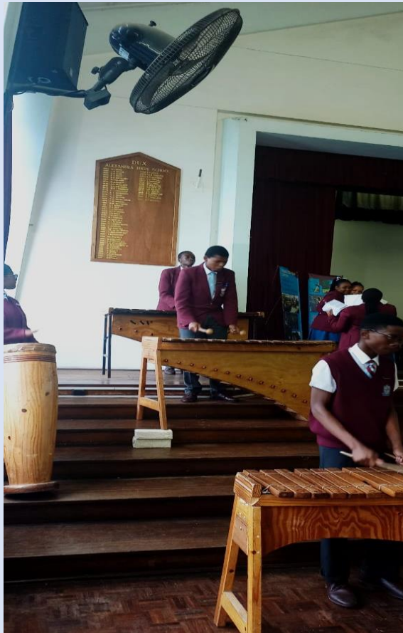
SHOWCASING THEIR TALENT @ PRIZE-GIVING