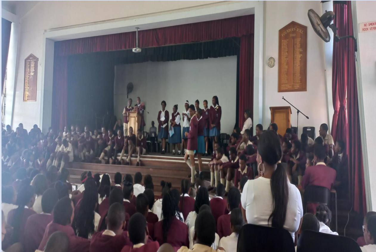
During the Assembly