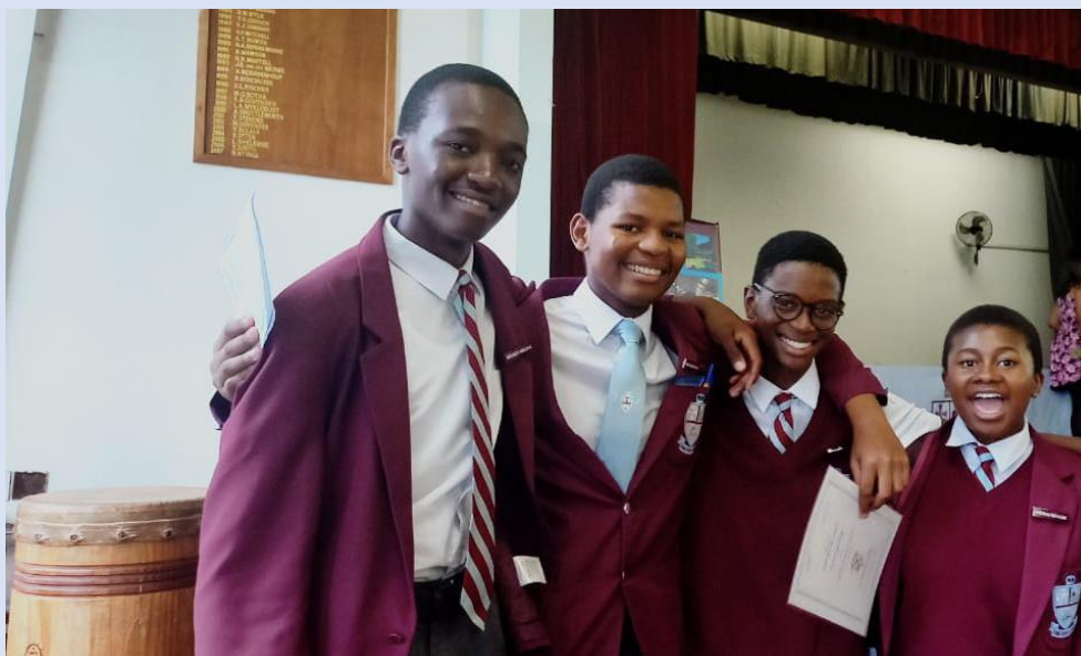
OUR AWESOME MARIMBA BAND