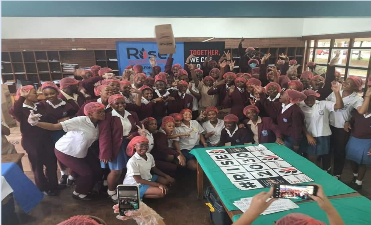
THE GRADE 9'S